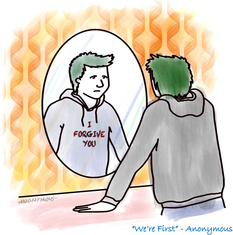
“We're First” - Anonymous

We want to be free of our guilt, but we don't wish to do so at the expense of anyone else. We might run the risk of involving a third person or some companion from our using days who does not wish to be exposed.